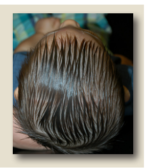
6 months after forehead reconstruction

The surgery and post-operative course were uneventful. All sutures were removed by post op week 2. All cranial defects were closed by post op month 3. The plates and screws that were used during surgery were resorbable, and were no longer palpable by post op month 6.